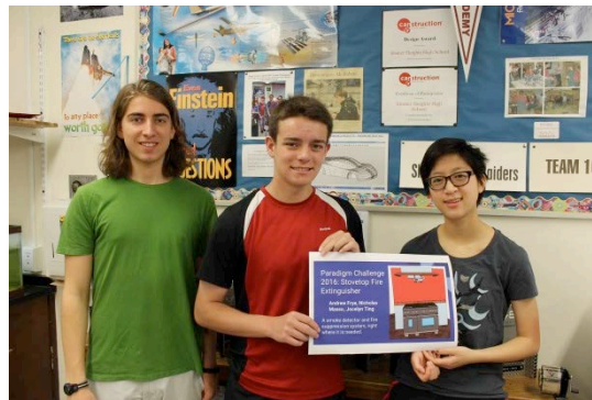
Robotics Club members